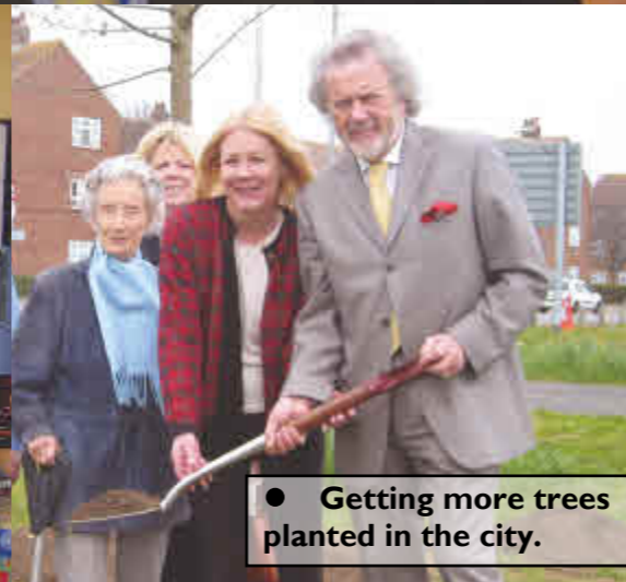
● Getting more trees planted in the city.