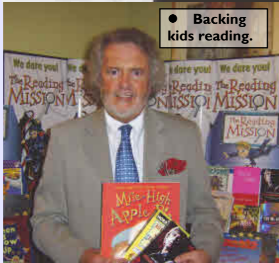
● Backing kids reading.