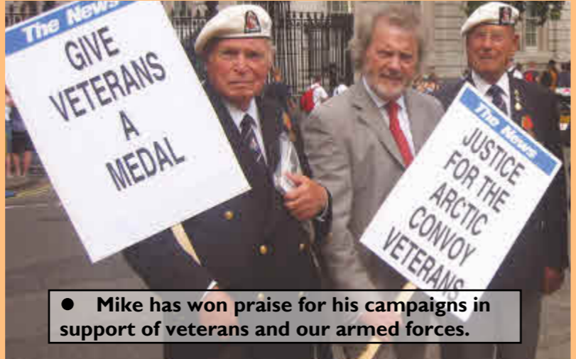
● Mike has won praise for his campaigns in support of veterans and our armed forces.

Local MP, Mike Hancock has helped many thousands of local residents with problems since becoming our MP. Last year Mike Hancock and his office dealt with over 10,000 enquiries and problems. If you have a problem or an issue you would like to raise with Mike, please contact him today using the details below. Mike's first priority as our local MP is to always be there to help when a local resident needs it.